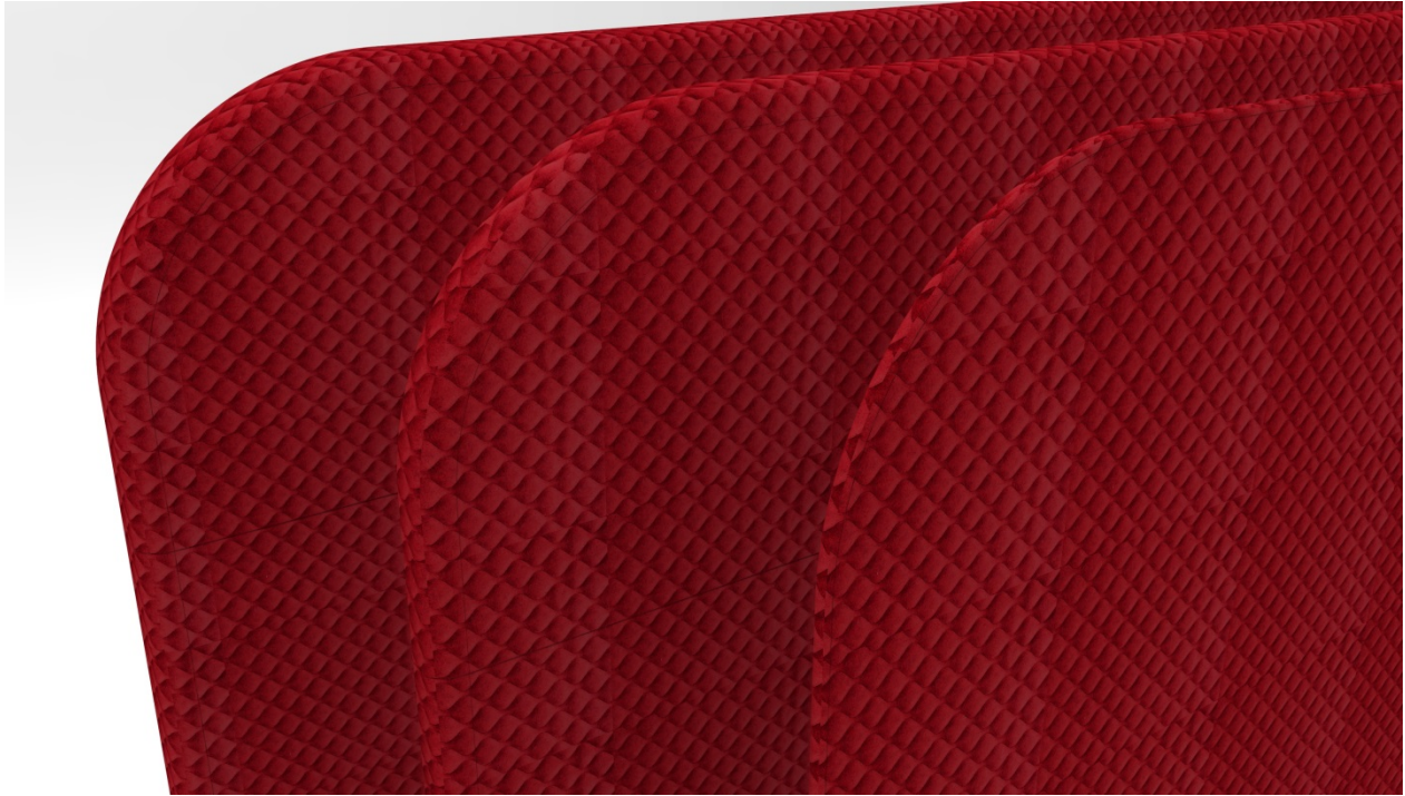
parvento S,M, L