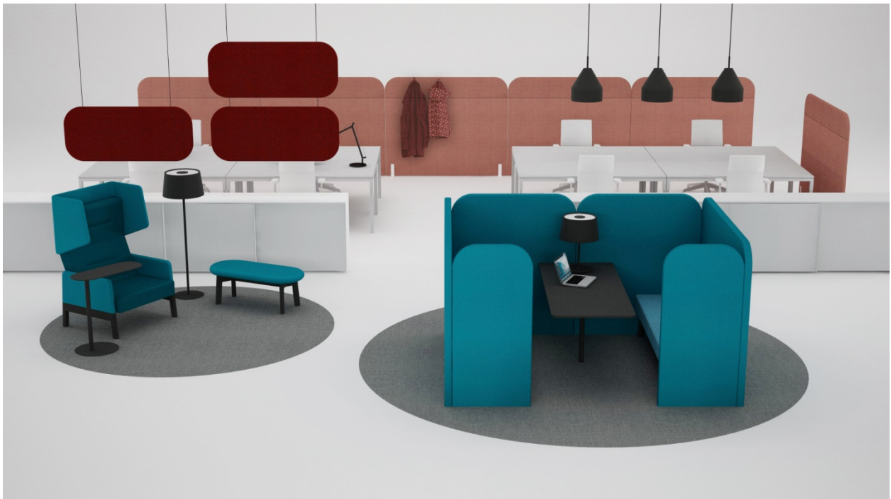
partitioning system paravento