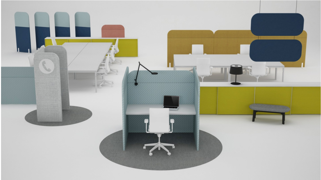
partitioning system paravento