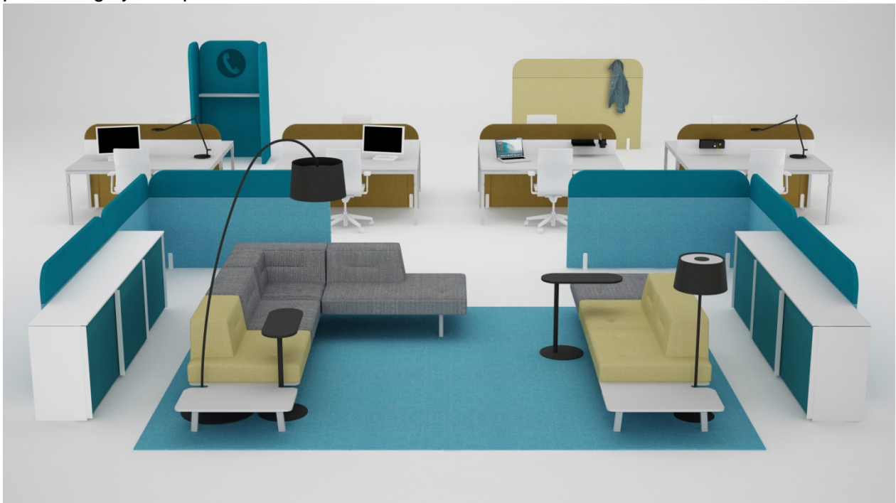
partitioning system paravento